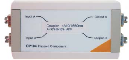
Model OP104 Passive component module with singlemode splitter 90/10 installed, APC termination