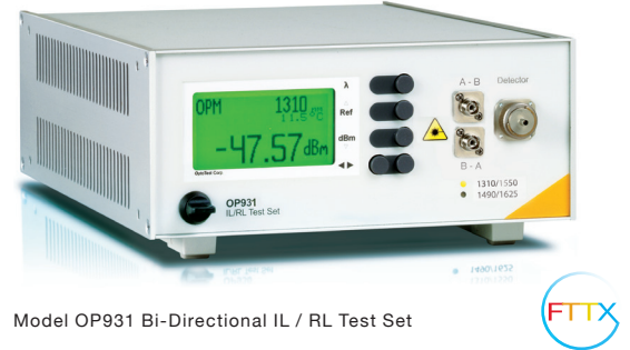
Model OP931 Bi-Directional IL / RL Test Set

Bi-Directional Insertion Loss (IL) and Return Loss (RL) on fiber optic components are measured fast and accurately with the OP931 bi-directional . Return loss is measured using the “no mandrel” method, meaning neither matching gel nor mandrel wraps are required at the far end of the cable. Insertion loss is measured with a continuous and stabilized source of the test set in combination with one of the built-in precision optical power meters. To measure IL/RL in A-B and B-A direction the internal 2x2 optical switch executes a fast bi-directional measurement of IL and RL.