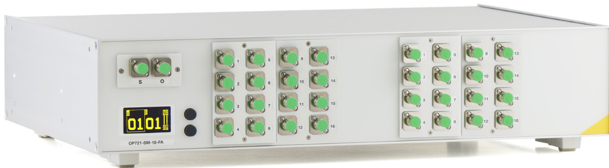
Model OP721-SM-16 Bidirectional Optical Switch

The OP721 is an all-in-one bidirectional optical switch for single mode and multimode applications. This optical switch is powered by an external 5V power supply and incorporates the latest in high-speed switching technology. By combining the high channel count capability of the OP720 with the 2x2 configuration of the OP725, the OP721 is ideally suited for multifiber bidirectional testing.