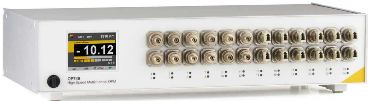
24 channel OP740 high-speed multichannel OPM

OptoTest's OP740 boasts sampling rates of up to 125,000 samples per second and is available with up to 24 channels per unit. High-speed results are visible on the full color touchscreen display in user-configurable sets of up to 24 channels. This will allow the user to view power readings for multiple channels at the same time without using software, simplifying test procedures where data doesn't need to be recorded but optical power needs to be monitored.