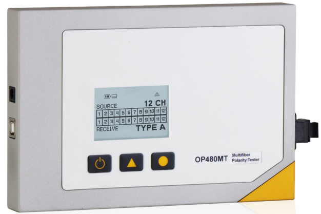
The OP480MT provides a simple, handheld solution for testing polarity of multifiber connectors such as MTP/MPO, MXC, and PRIZM.