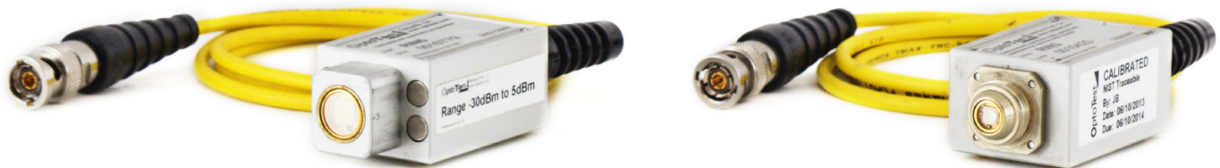
Figure 2: 10mm InGaAs detector (left), 3mm Si detector (right).

NOTE: MTP®, PRIZM®, and MXC™ are registered trademarks of US Conec.